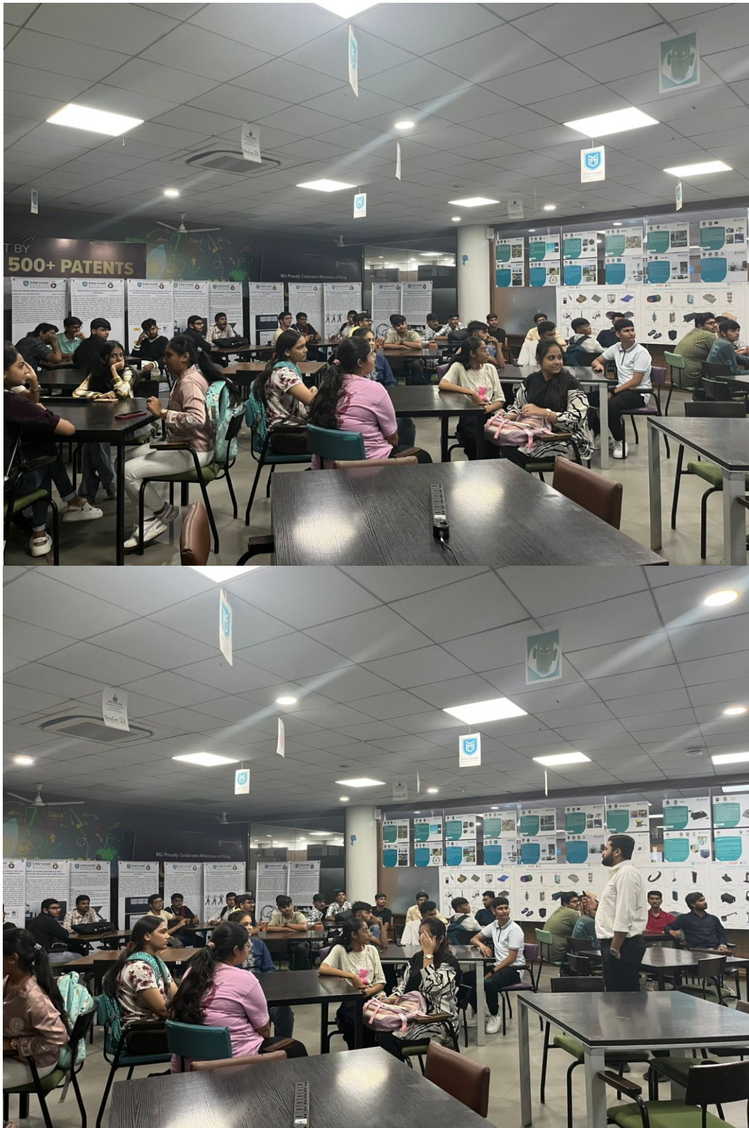
Glimpse of the Sensitization session on Innovation and Entrepreneurship for MU Students